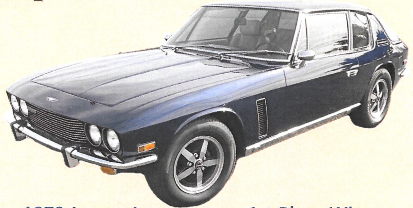
1972 Jensen Interceptor – 1st Place Winner "Other British Cars" 2023 Annual Fall Car Show

Between US Route 13 & Old New Castle, DE 19720