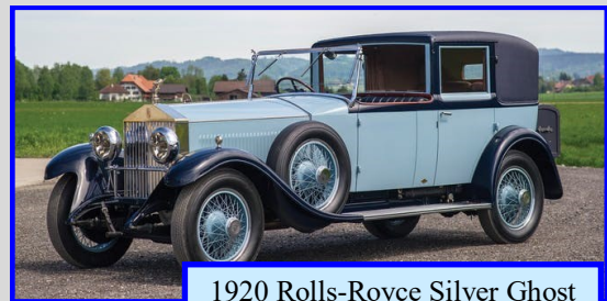
1920 Rolls-Royce Silver Ghost "Coupé Chauffeur"

This brings us to the LBC. What vehicle can make a couple happy who experience a 50/50 split on a desire to be dry 100% of the time while driving with the other half who still have prehistoric tendencies to get wet. British ingenuity: the two-seat open roadster.