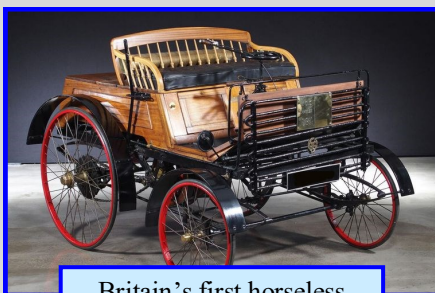
Britain's first horseless carriage, the "Malvernian"

to the industrial revolution when living in a foul, polluted slum was better than where you came from. At least you could get out of the rain for a bit. The Brits were tough cookies (or biscuits or whatever). Industry marched on and steam engines appeared. Then what we've all been waiting for—the automobile.