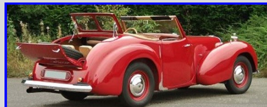
Triumph’s answer for getting everyone wet.