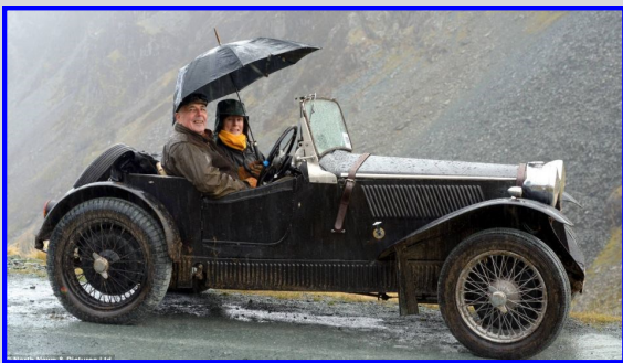
There will always be an England Rain or Shine