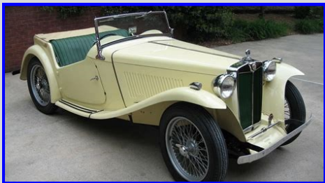
MGTC Suicide doors

So there you have it; the LBCs we so dearly and inexplicably love, are driven by wonderful people who sometimes get wet. -editor