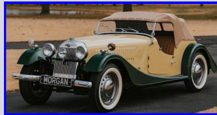
Morgan doors went the other way.