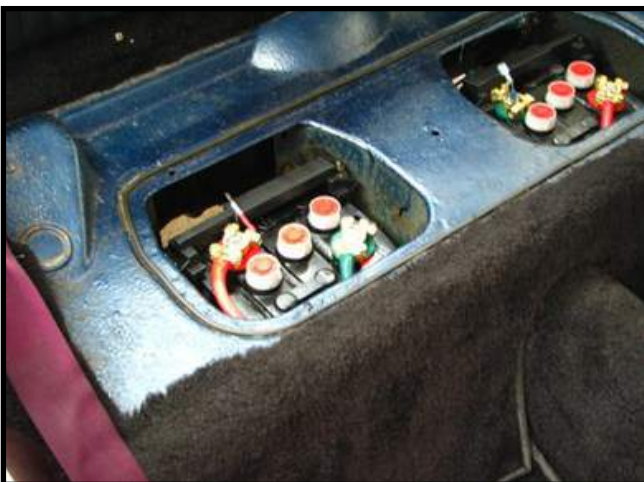
Two 6 volt battery setup

I was also using a single 12-volt battery in my MGA, so that was a simple cable change. The original cars came from the factory with two 6-volt batteries. The reason for this was at the time 12-volt batteries were too big to fit in the space behind the seats in the battery box. Unless the car is a concourse auto, most folks use a single 12-volt battery since modern batteries are small and powerful enough to work. Also, take care to position the battery such that the positive post is not in danger of shorting out to the cars frame.