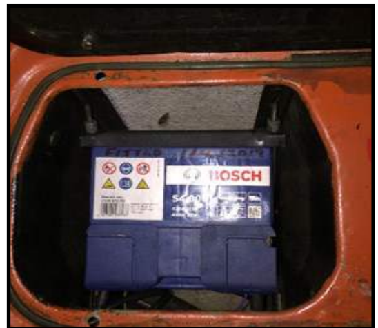
A single 12 volt installation