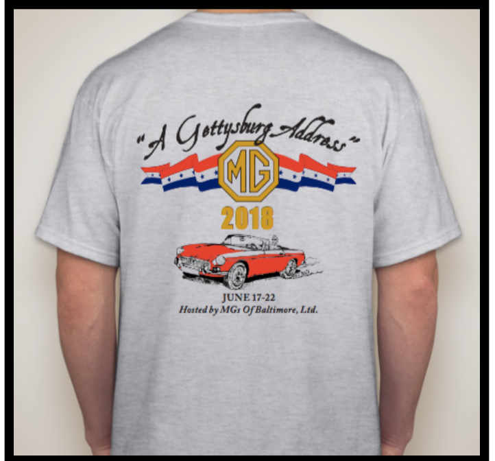
New REAR design for MG2018 Tee shirt

After the powers that be saw the initial design for the MG2018 convention, they chose to remove the flags that had been drawn to fit the Civil War theme of Gettysburg PA location for this show. Above are the replacement designs for the 2018 event.