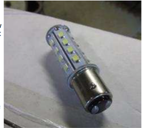
This is a close up view of the LED that replaces the Type 1157 bulb in the front turn signal. It has the same light output (with the brakes applied) as the latest turn signal LED discussed earlier.

I have seen recommendations that the LED color should match the color of the lens, i.e. the brake light LED color should be red. Quite often, the light output for red or amber LED's is not as high as the white LED's. I personally prefer to use the white LED's with the significantly higher light output for most applications.