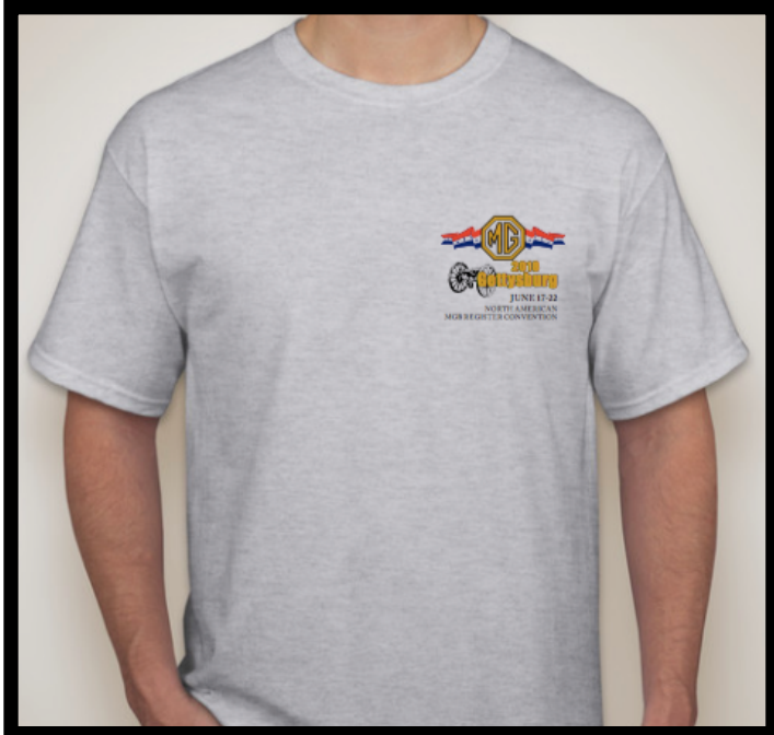
New FRONT design for MG2018 Tee shirt