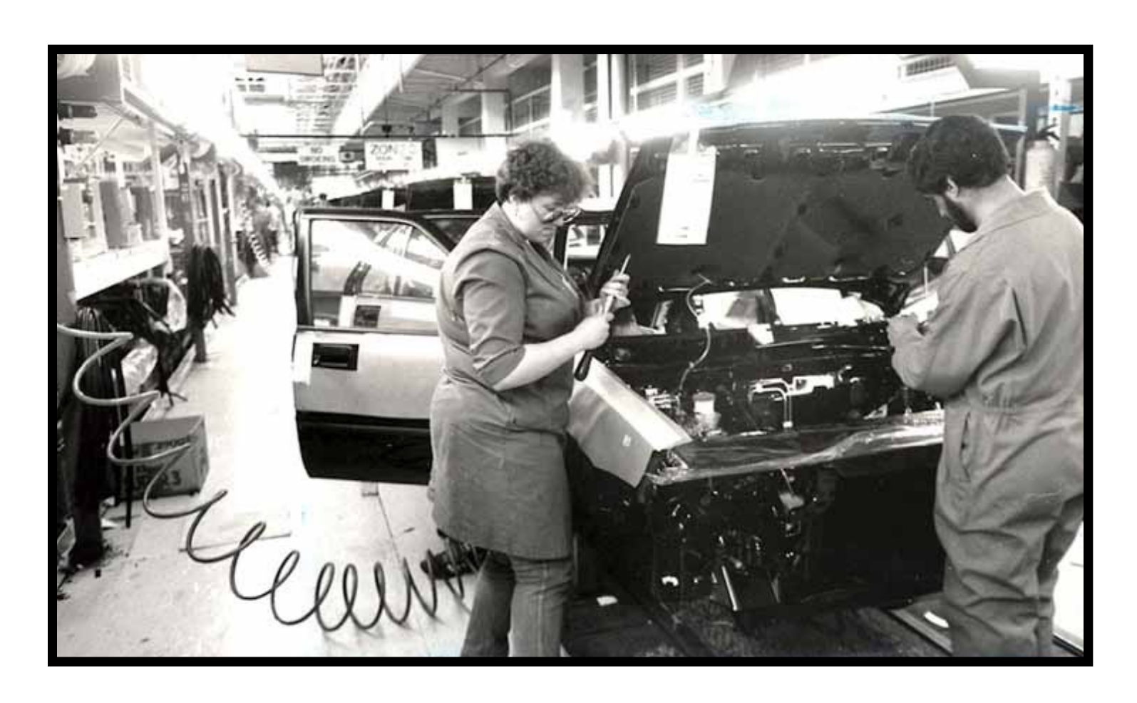
12 www.mgtoronto.com Octagon | Spring | 2017

July 2006: Nanjing Automotive announces plans to start limited production of the MGF sports car at the factory and that around 250 workers could initially be employed on the project.